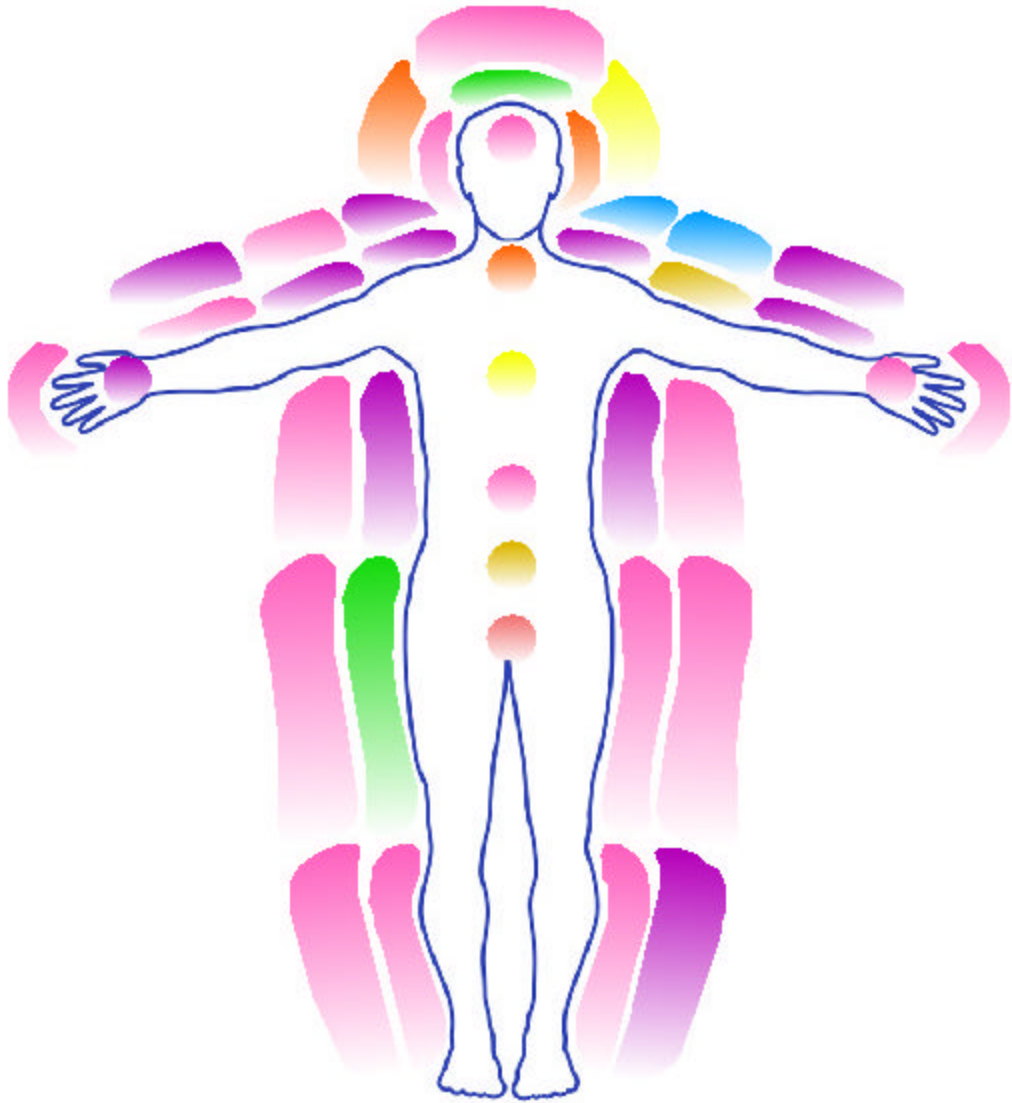
Louise – August 2004, Following 12 Consecutive Weeks of Therapy