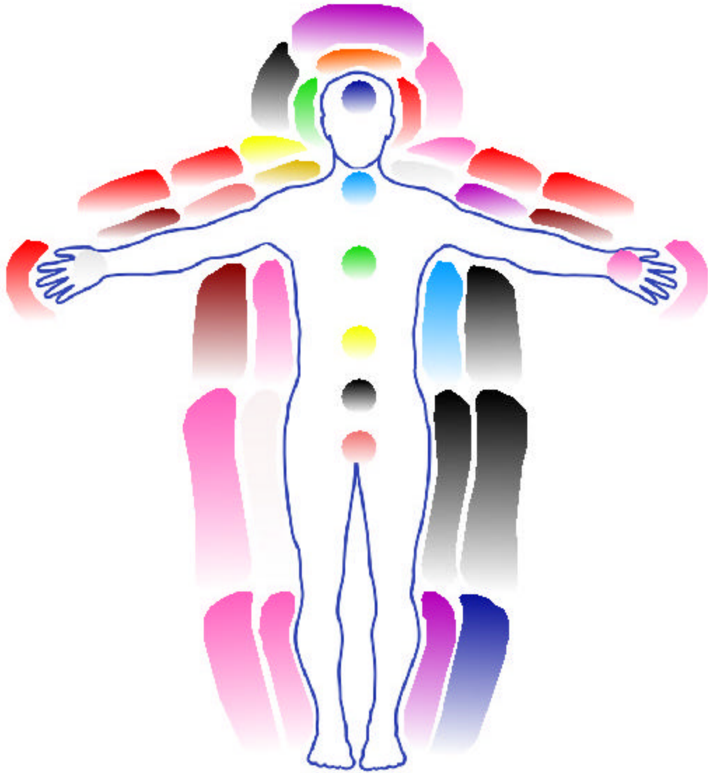
Louise – May 2004, Before Hypnotherapy and Sound Therapy

Below is Louise's final reading for RFI™ at the end of her therapy. Notice that the aura field is almost entirely orchid and purple, indicating a harmonic association between mind and body. This is a very healthy energy field. Notice that all areas of red, burgundy and black have been replaced with "softer" colors, such as orchid (spiritual focus), purple (psychosomatic connection), gold (healing), orange (healing) and blue (communication).