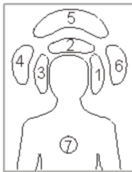
Figure 2 - Points Measured by RFI™

The six points around the head, as shown in Figure 2 below, represent the cerebral area, or the predominant thought area. During the stress reduction exercise, the thought pattern shifts and upon retesting the new frequencies are recorded in the same sequence as before the stress reduction. The first three points relate to the physical head area, while points 4, 5 and 6 relate to the psychological, or mental and emotional body. The physical points are measured 0 to 4 inches from the body, while the psychological points are measured 4 to 18 inches from the body. The heart chakra point was also included since the Heart Math Freeze-Framer program uses the heart energy as its major focus. The seven charkas in the energetic body relate to specific glands of the endocrine system. The heart chakra point is located at number 7 (Figure 2) and was tested at 4 to 8 inches away from the body.