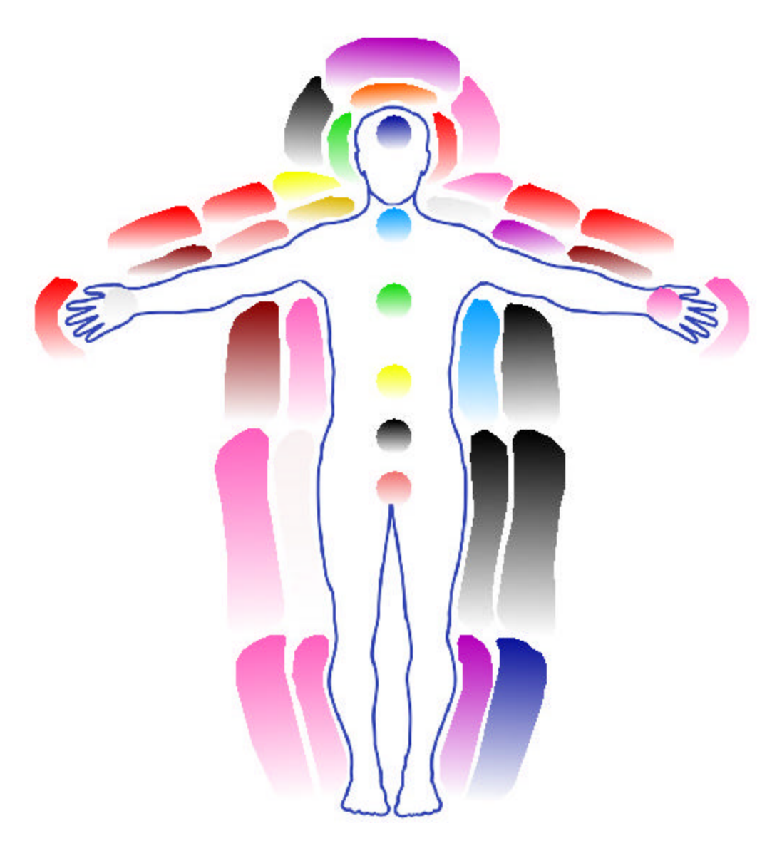
Louise – May 2004, Before Hypnotherapy and Sound Therapy

Below is Louise's final reading for RFITM at the end of her therapy. Notice that the aura field is almost entirely orchid and purple, indicating a harmonic association between mind and body. This is a very healthy energy field. Notice that all areas of red, burgundy and black have been replaced with "softer" colors, such as orchid (spiritual focus), purple (psychosomatic connection), gold (healing), orange (healing) and blue (communication).